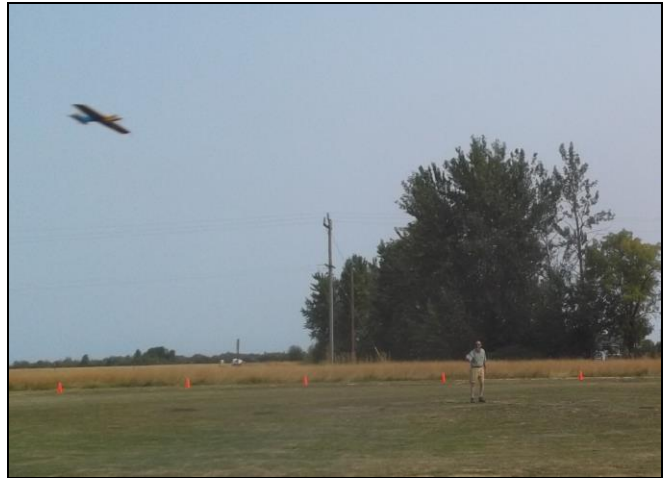
Out of fuel