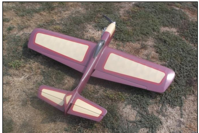
No stars left for the Skylark