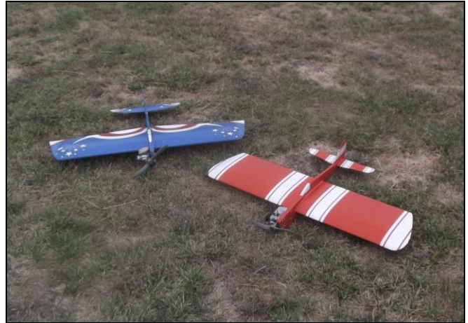
Gary's flight line