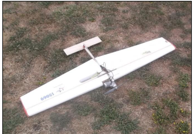
Now it is ready