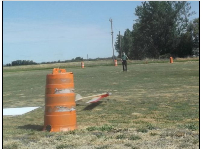
Floyd taking off