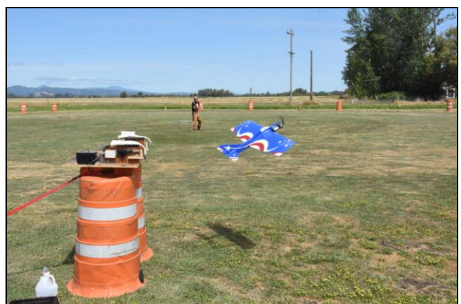
Gary's Flite Streak takes off from the remote-controlled launcher.