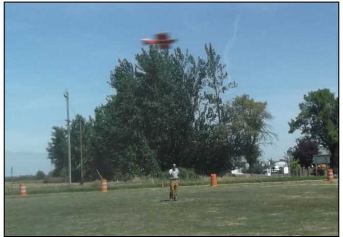
Gary flying Buster