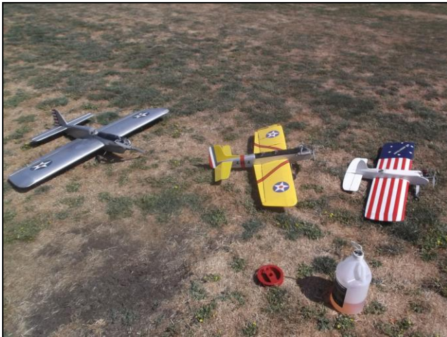
Dave's planes waiting