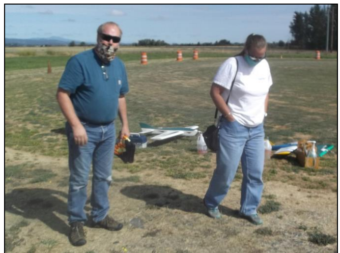
"Phantom Regionals" shirt purchasers