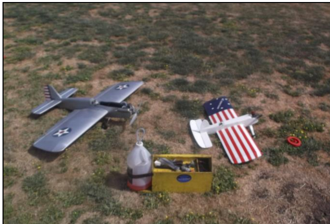
Dave's planes waiting