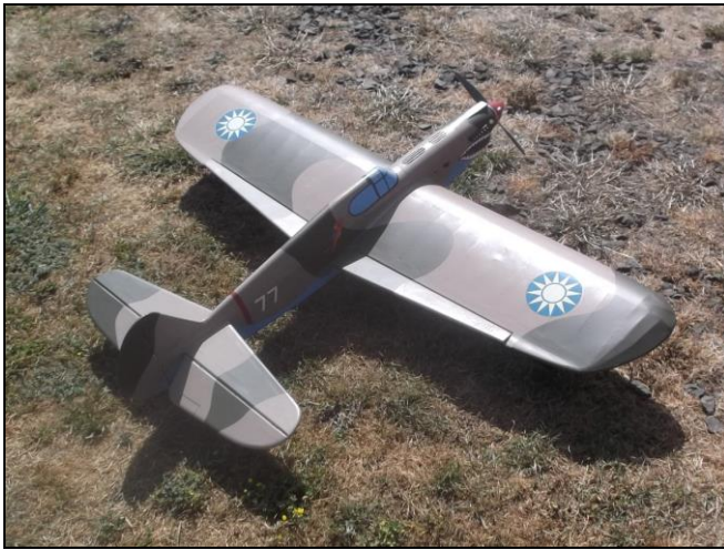
Waiting for less wind