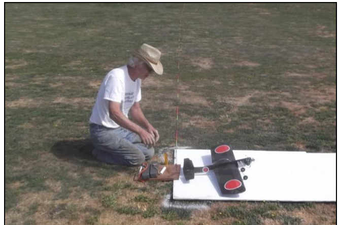
This one ready to launch