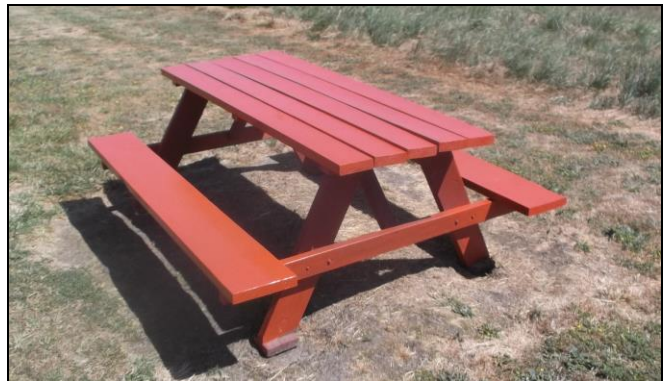
New seats installed and the top painted. Thanks Gary for the seats and paint.