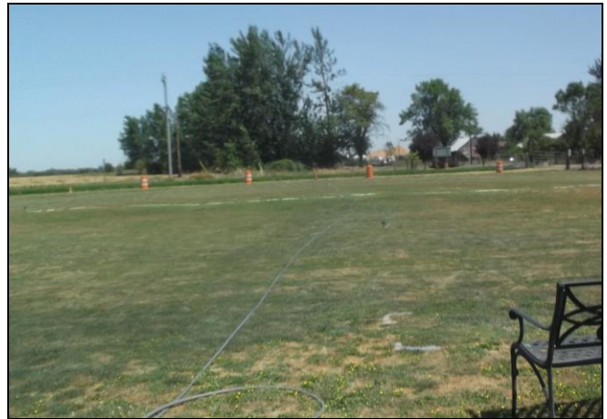
Sprinklers back on circle