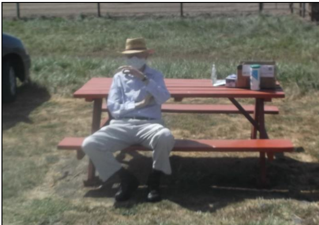
Dean watching the action