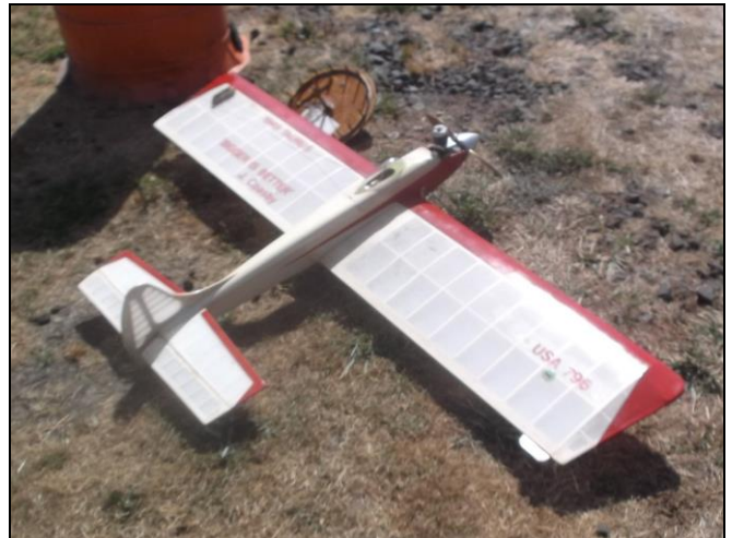
Floyd's plane waiting