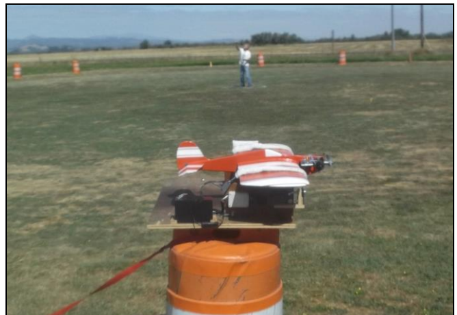
Gary's Buster waiting to launch