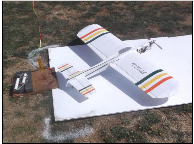
Mark's plane ready to start