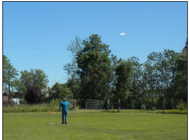
Russ in the air