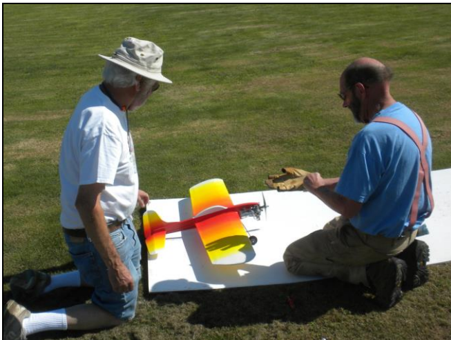
Ready to start