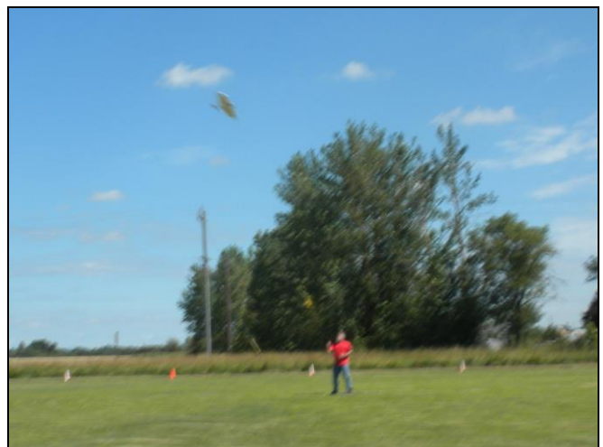
Russ making a landing approach