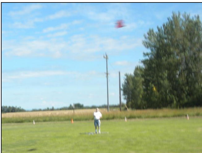
Electric in the air