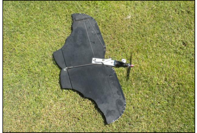
Jim's half-A bat wing