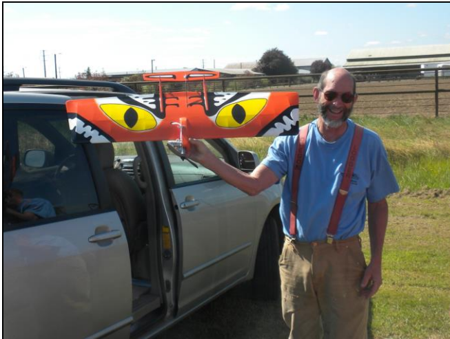
Gary's Combat Cat ready for maiden flight