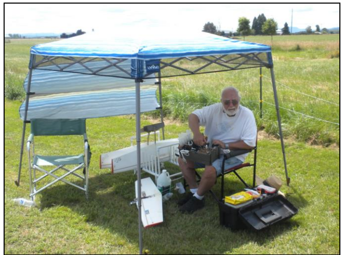
Gene prepping a plane