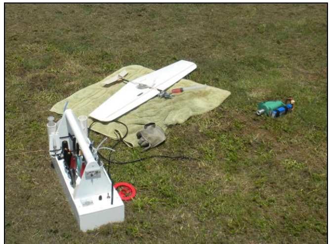
Russ has a plane waiting