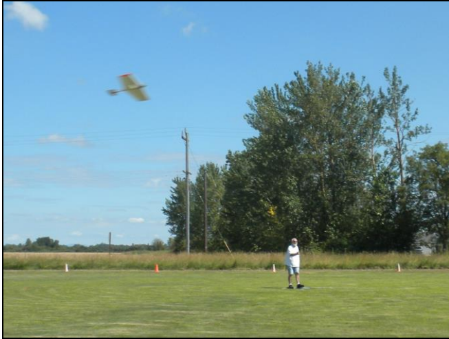
Gene about to land