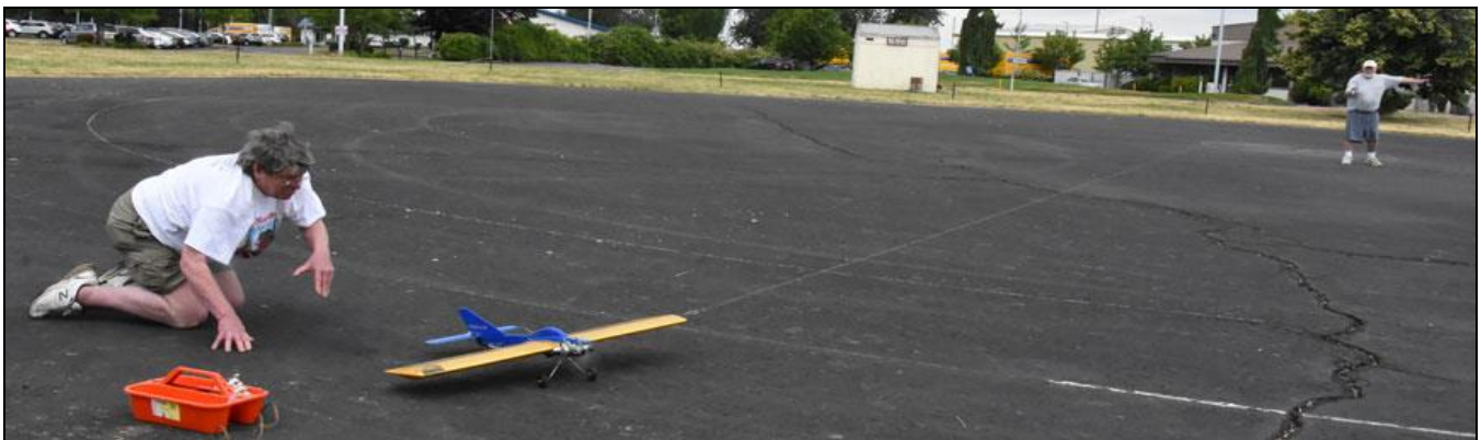
Flying Lines photo