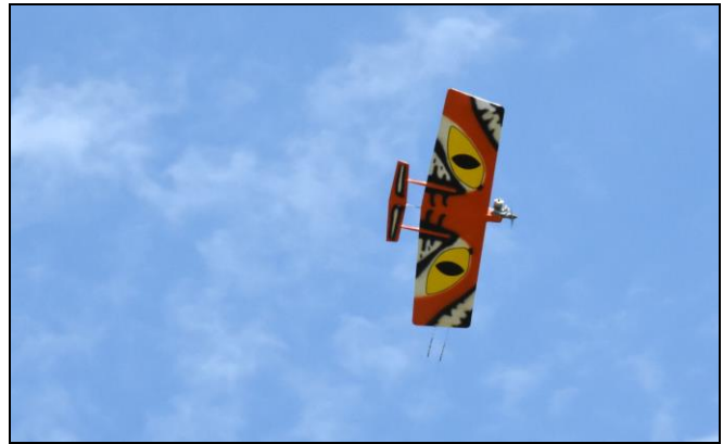
In the air

Lucky Hand Fun Fly 2022 - Salem, Ore., July 2, 2022