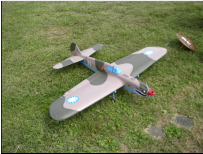
Control lines connected