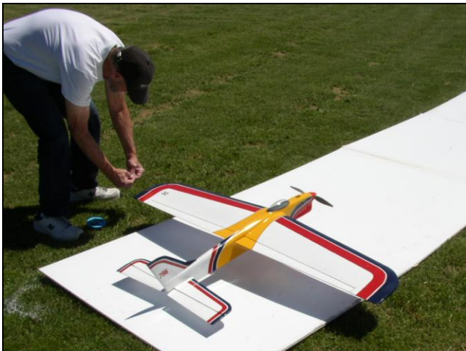
Connecting control lines