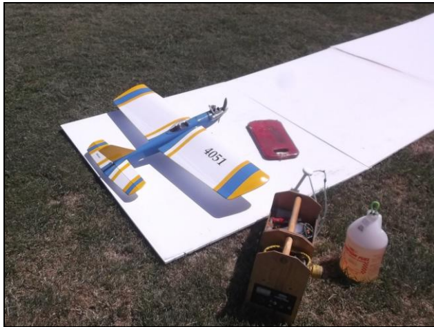
Ready to fly