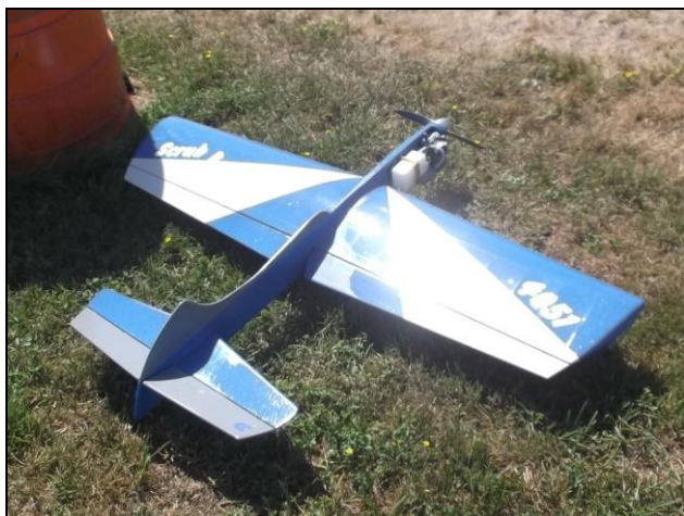
Scrub J waiting