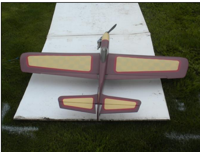
Gary's Skylark ready