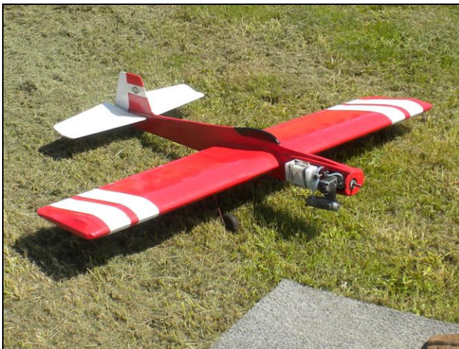
Needs a prop