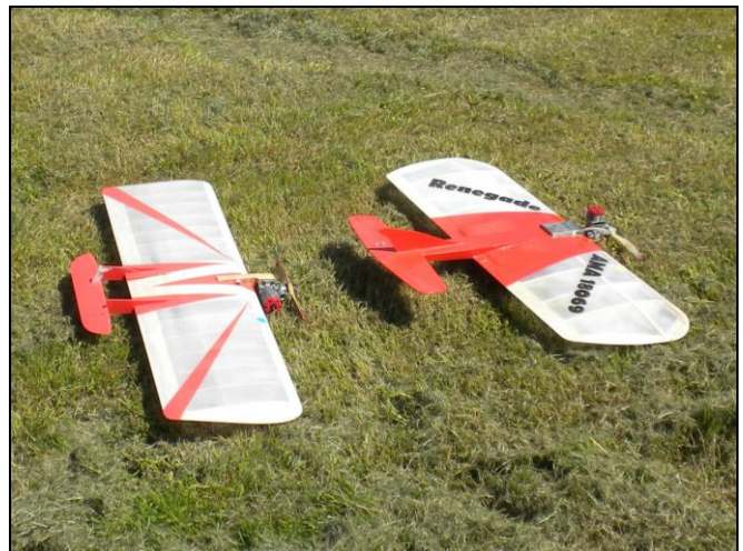
Gene has two ready to fly