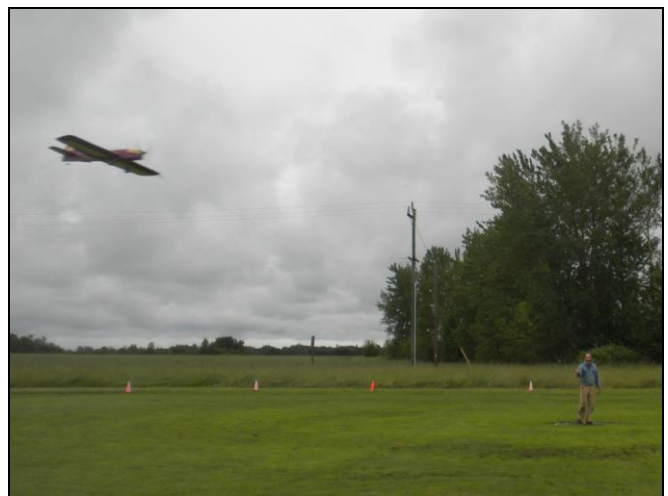
And in the air