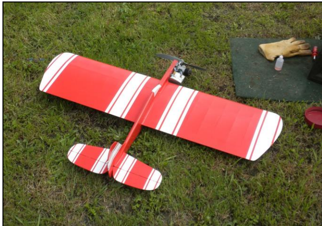
Gary fueled it