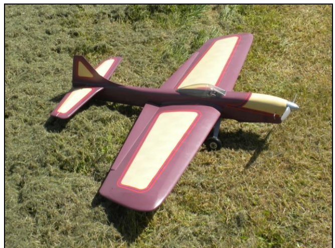
Gary's Skylark ready