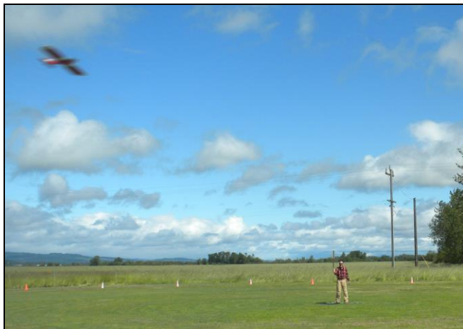
And then flew it