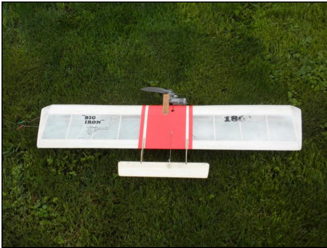
Gene's Big Iron