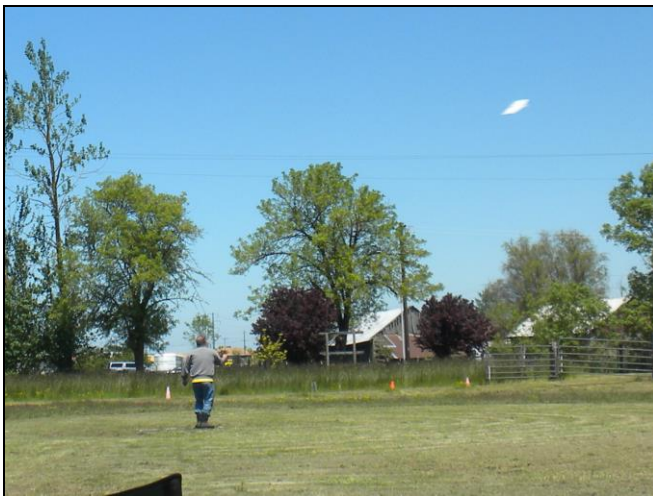
Russ ready to land