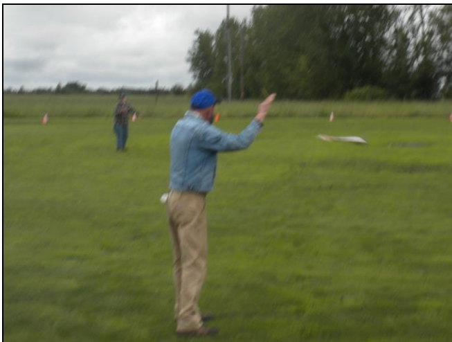
Big Iron gets launched