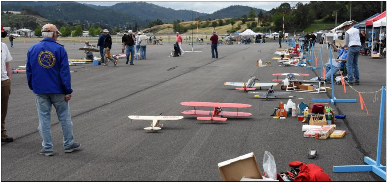
Flying Lines photo.

Roseburg Regional Airport provides plenty of space for this large contest. View from the north end of the field near the Scale pits shows the stunt pits, with Speed/Racing circle at the south end of the asphalt, and Combat in the grass area farther south. Carrier is out of the picture to the right of the combat circle.