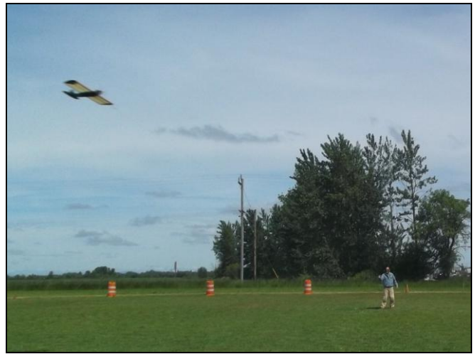
Gary flying Buster