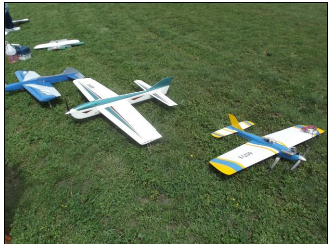
Waiting to fly