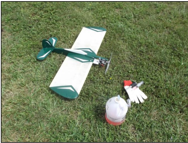
Gary's Buster waiting