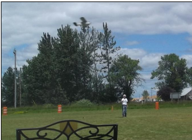
Dave's biplane in the air