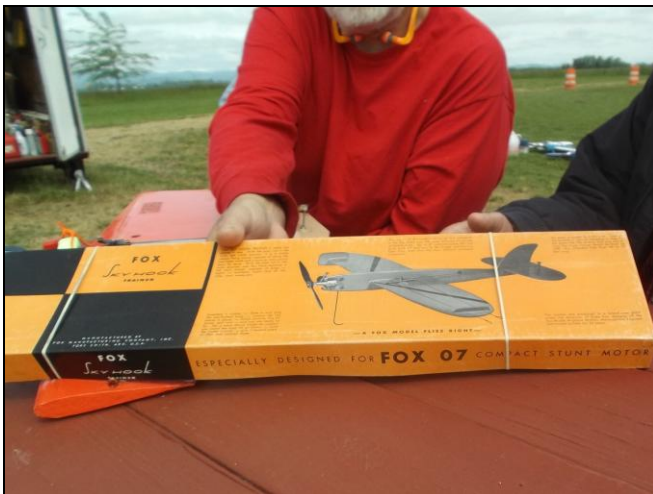
Wayne brought a vintage Fox KIT to show