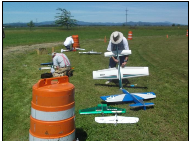
Pilots getting planes ready