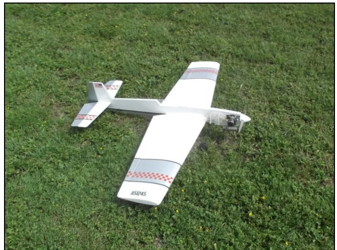
Landed it well