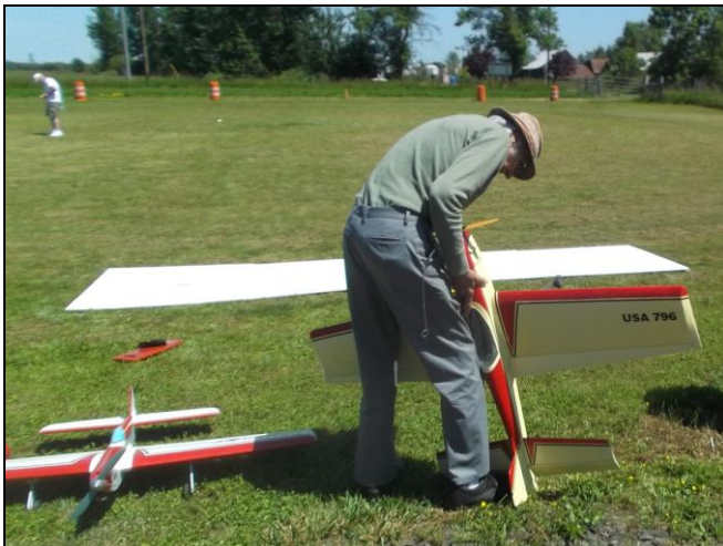
Floyd getting planes ready