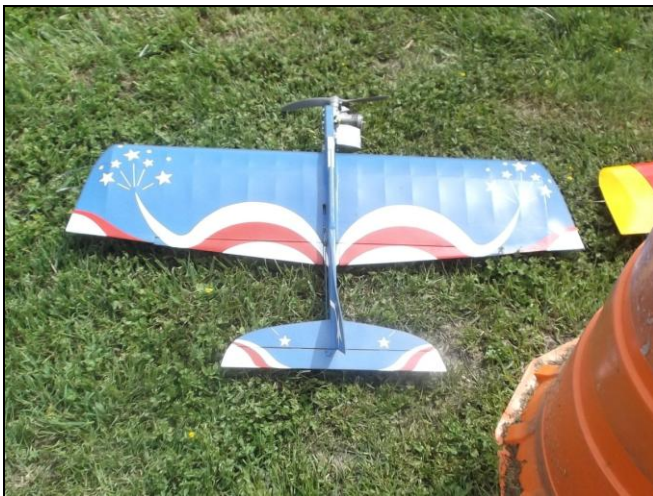
Some aircraft look good even at rest