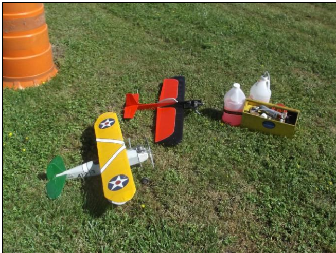
Dave's planes ready