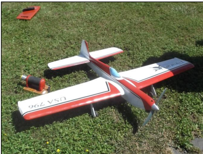
Floyd's Tiburon ready