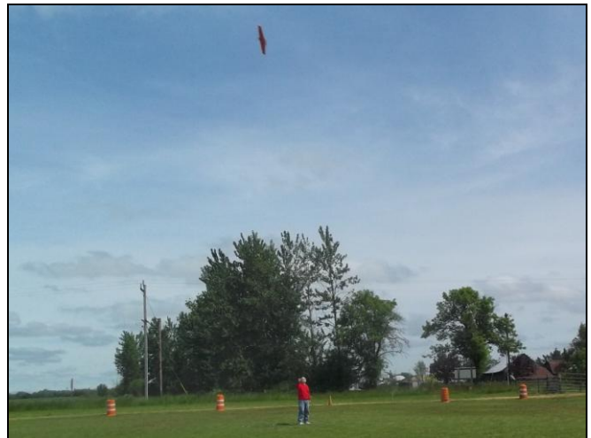
Then flew it