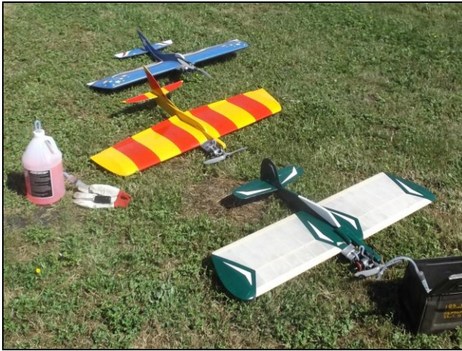
Gary planes ready