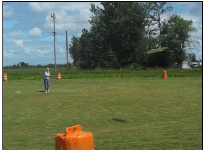
Gene's wing faster than its shadow