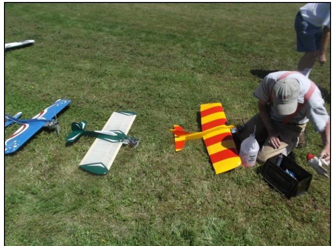
Gary getting planes ready