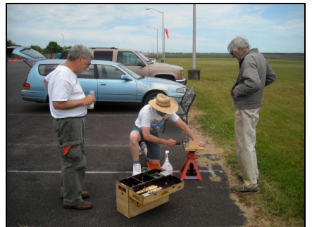
Yes, it takes three to start it