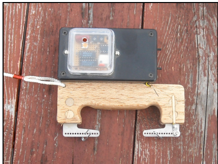
Floyd's elect retract system