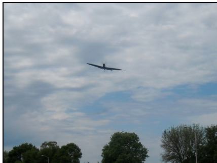
Look ma, no wheels