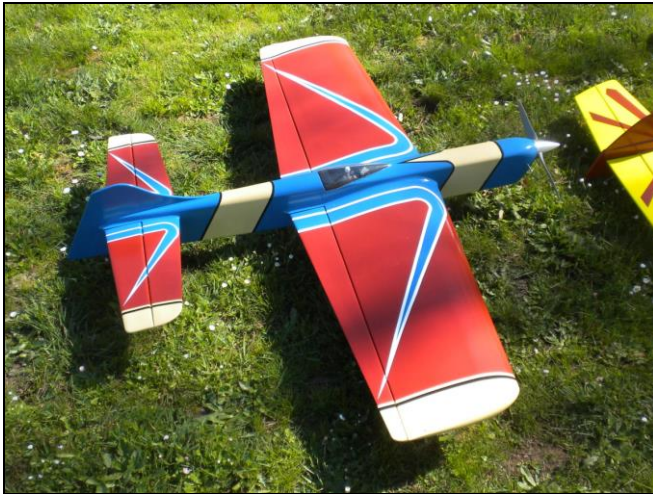
Gary's Vector 40