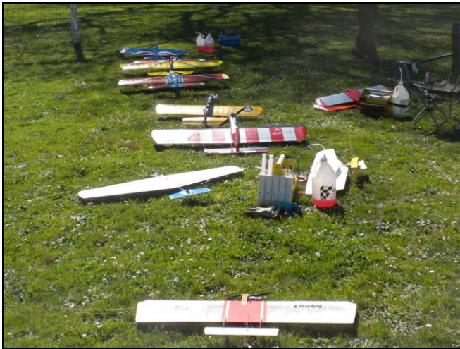
Waiting for pilots