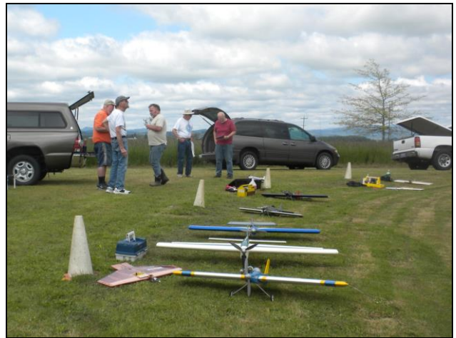
People and planes