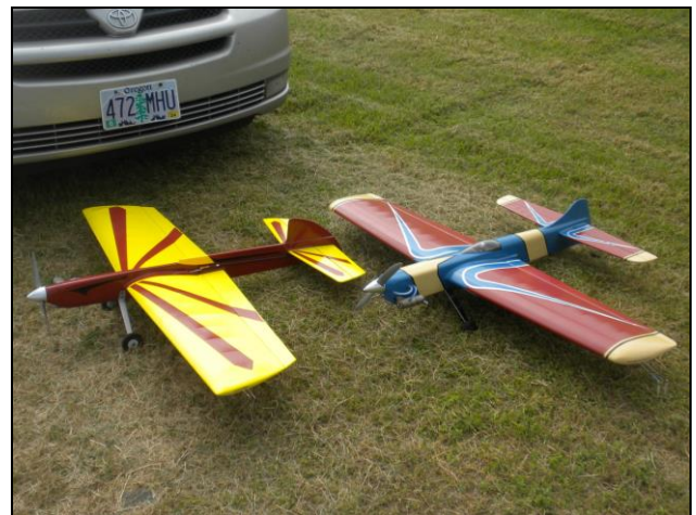
Two of Gary's planes