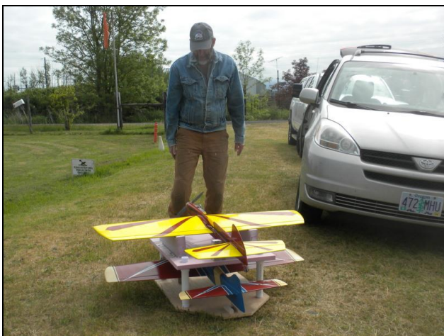
Gary's double decker transporter