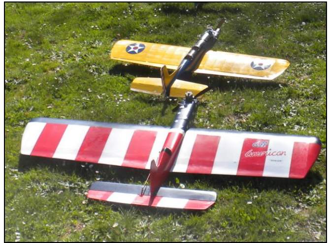
Two of Dave's planes