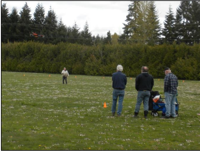
Backward flying draws spectators