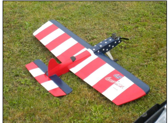
Dave's plane waiting