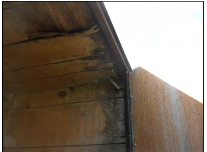
Needs some repair