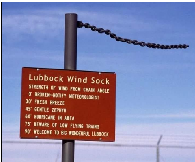
Lubbock Wind Sock