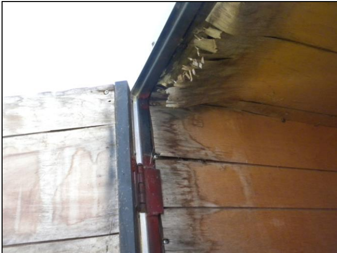
Club trailer leaking