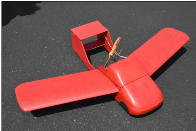
Dave Shrum's flying car.