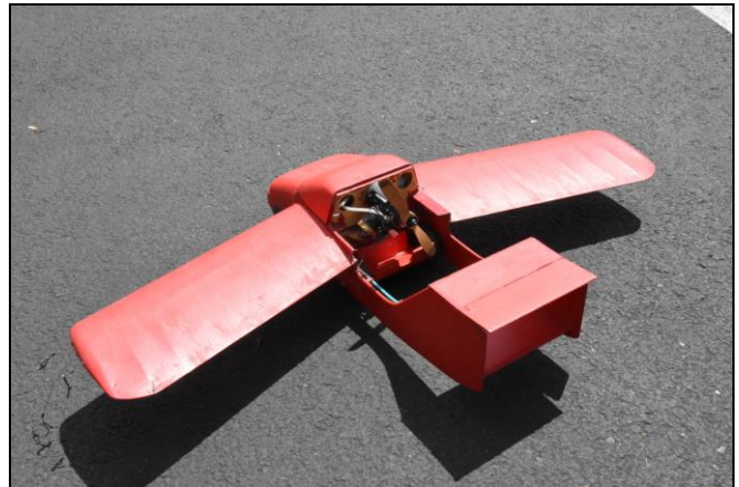
Dave Shrum's flying car.