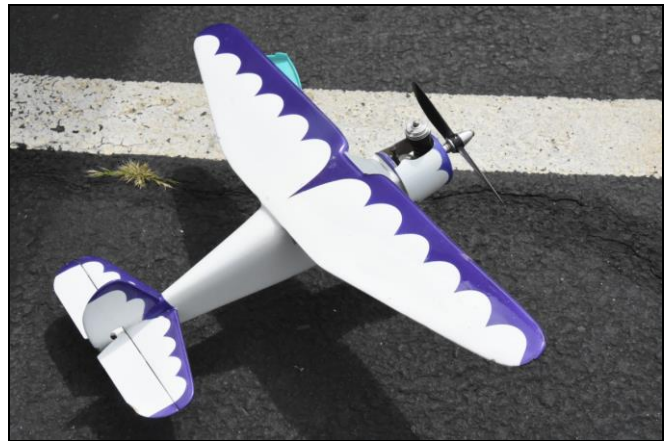
Walter Hicks plane