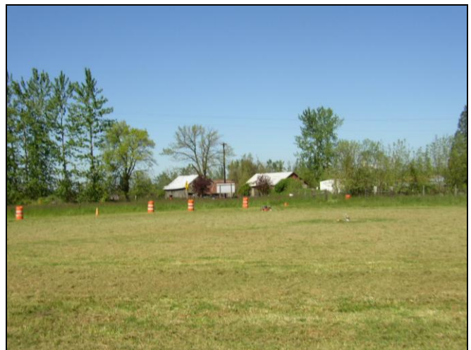
May 3 after some mowing