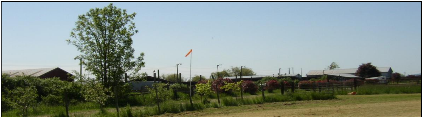
Not much wind