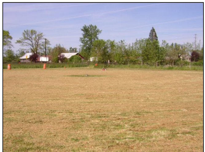
May 9 after a lot of mowing