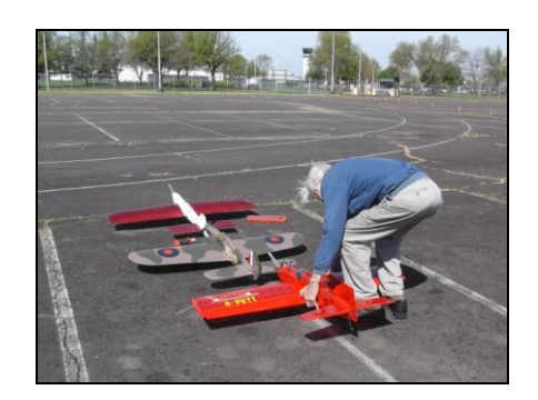
Flying at the Airport - April 23