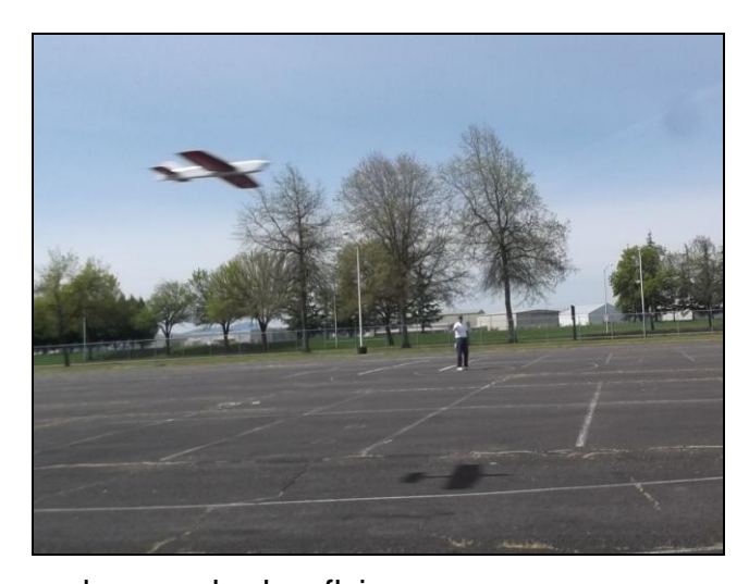
and some shadow flying