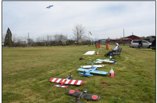
Overview of the pits, with Dave watching as Gary's Flite Streak passes.