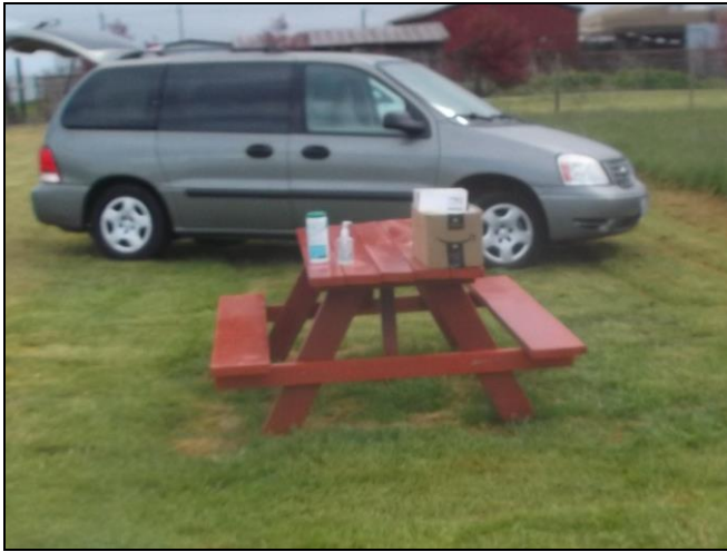
Gary repaired it.