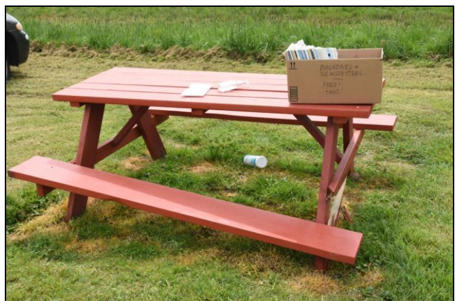
The bench broke with two people sitting on it. Gary says he will fix it.