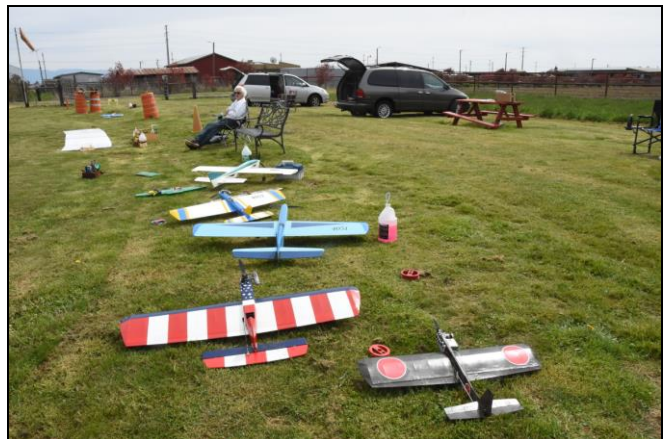
Closer view of pits.