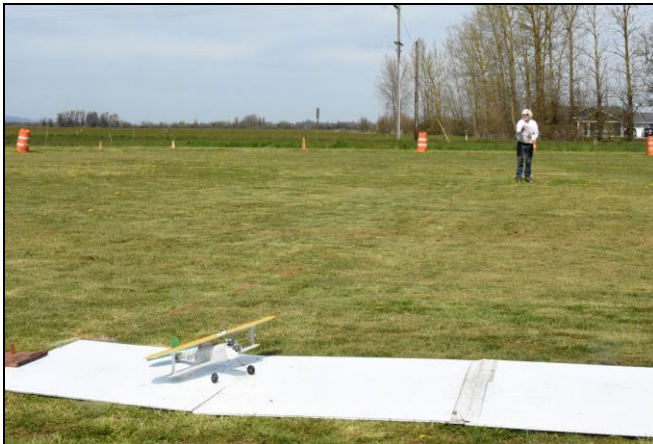
Dave's biplane takes off.