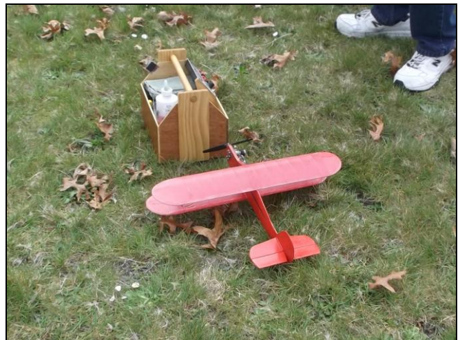
Safely back on the ground