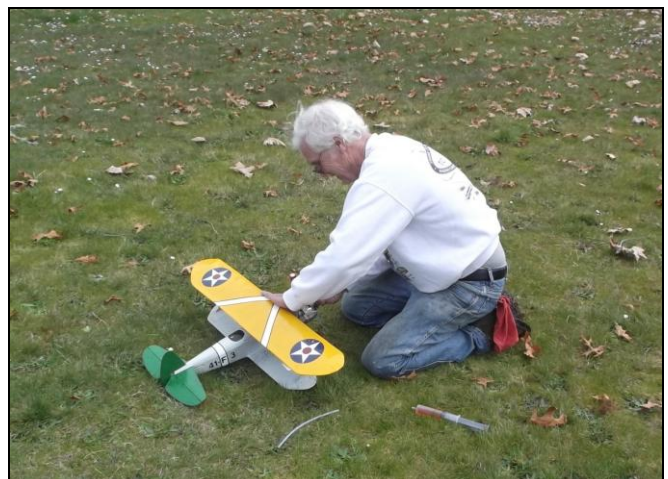
Changing the prop