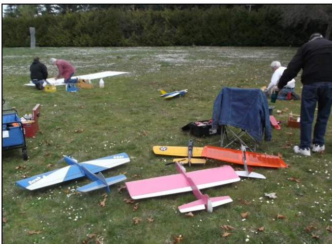
Aircraft ready to be flown