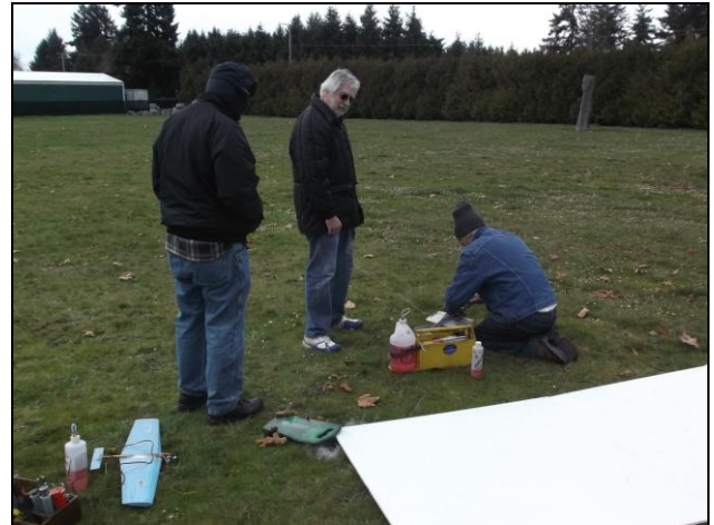
It should start now