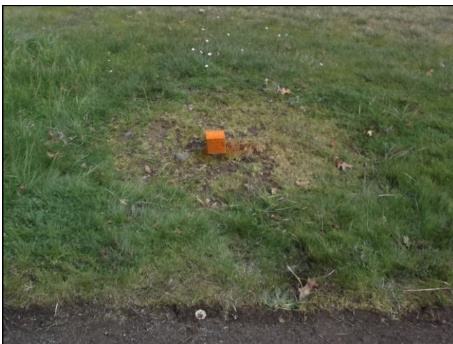
Bottom section cut off at ground level