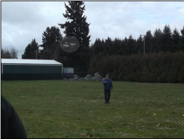
Hard to see, but it is flying