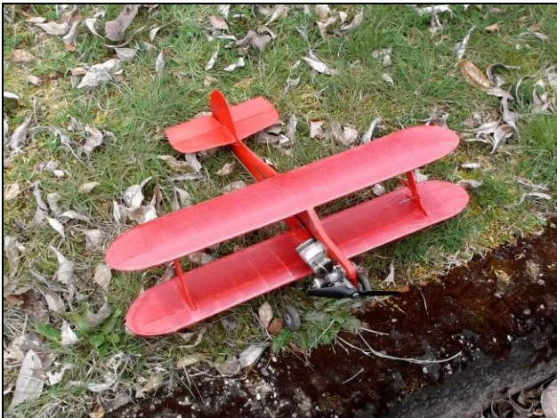
Ready to chase the clouds