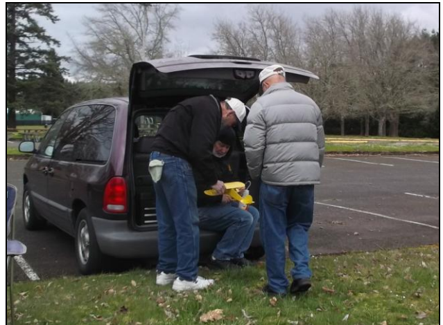
Prepping with assistance