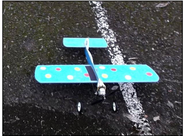
Landed right side up