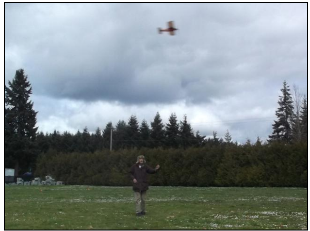
then flies it.