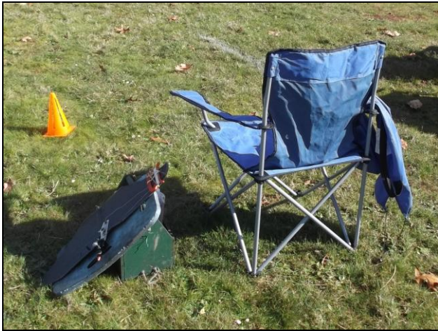
1/2a coroplast Bat waiting