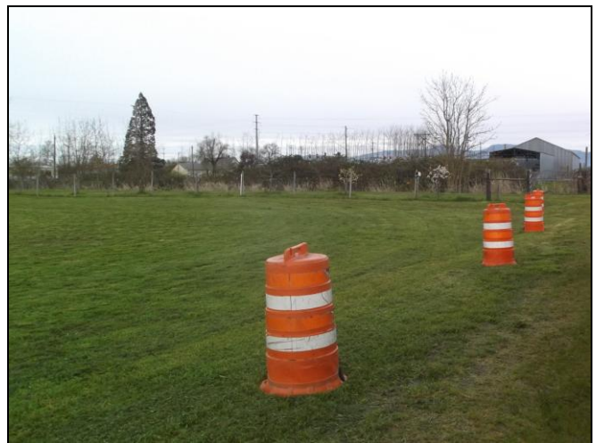
Circle and pit area mowed. Barrels placed around the circle. The ground is still very soft.