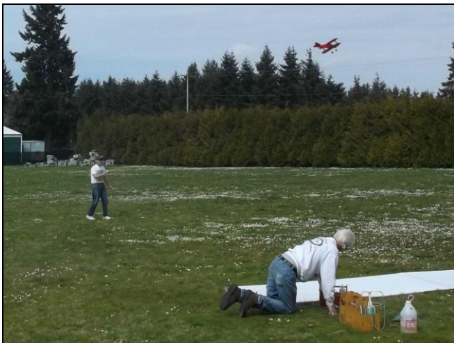
Mike's 1/2a Biplane in the air