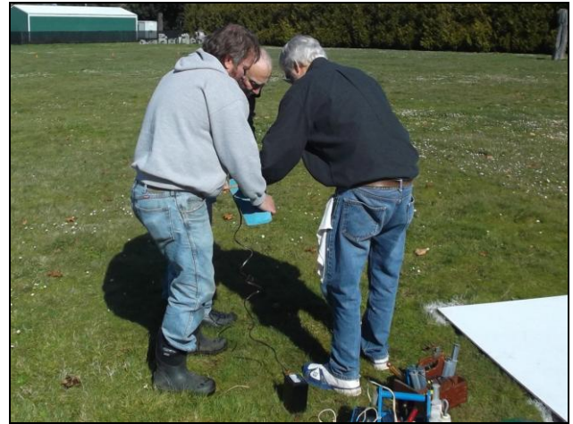
Sometimes it takes three to start a 1/2a