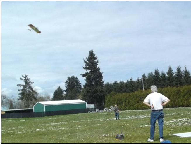
Gene ready to land