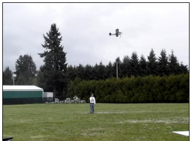
Dave's Biplane in the air