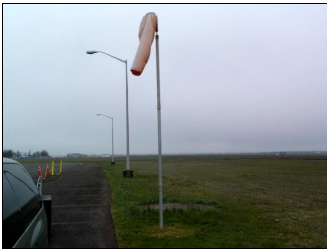
At the overflow parking lot.