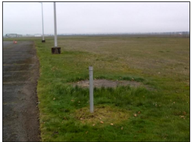
Top two sections removed