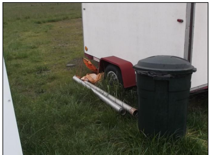
Stored at the ranch