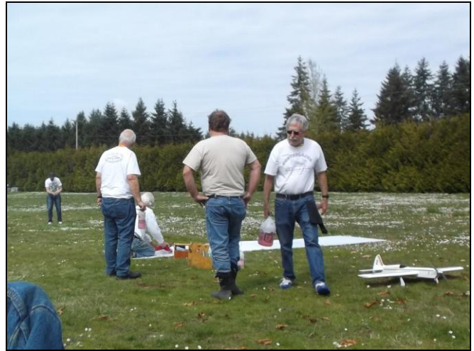
It is NOT snow, it is spring flowers