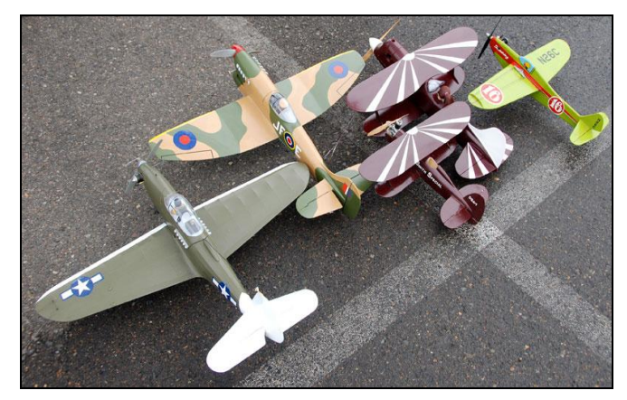
A display of really small airplanes brought by the Roseburg, Ore., fliers.

Weather had not been kind to control-line fliers in the 2017 Oregon Flying Fun series, but it cleared up for the fourth installment, as the fliers returned to the Evergreen Aviation & Space Museum grounds for the first time in two years. It was cloudy with a little drizzle early, but the weather improved steadily all day. Flying went on right past the door-prize hand out at 2:30 p.m. There was never more than a slight breeze, so CL modelers were able to entertain the trickle of spectators from among the museum visitors with a full range of types of flying. Sport, Stunt, Combat and Carrier planes were flown on one asphalt circle and one grass circle.