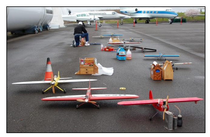
Some of the planes lined up in the pits with some of the museum's airplanes in the background.