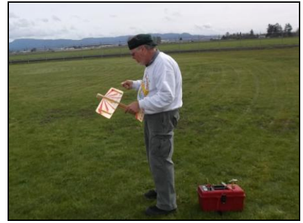
Just a little grass on it.