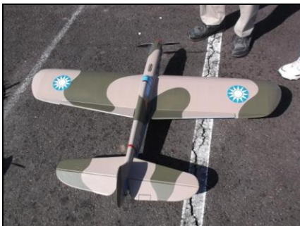
Floyd is ready to fly it.