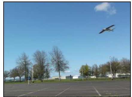
Flys upside down also.