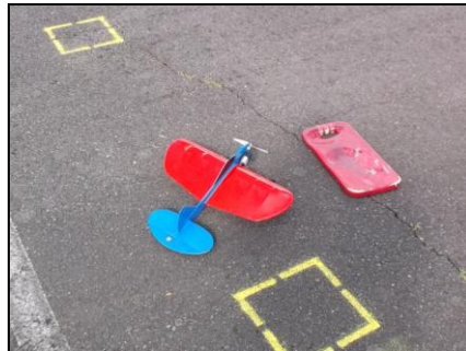
A little red one.