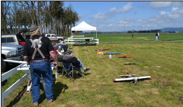
A look down the flight line shows the blue sky and a row of casual participants.

Perfect flying weather and great aviation setting for fun fly finale!