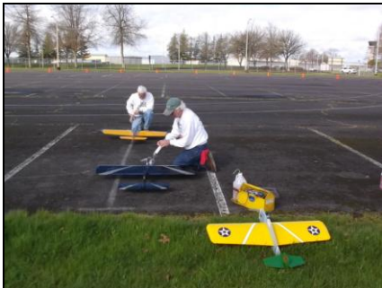
Almost ready line.