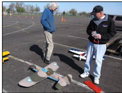
Admiring the new one