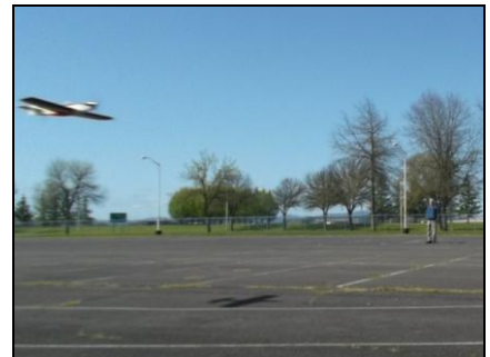
Wheels UP !