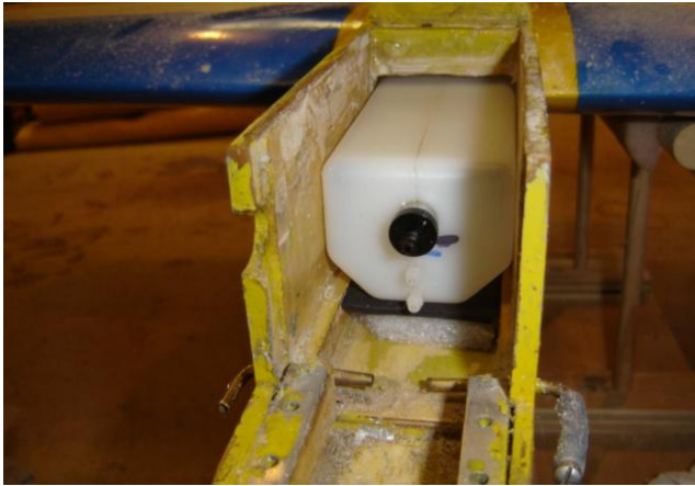
and one after installing the platform and cowl hold downs.