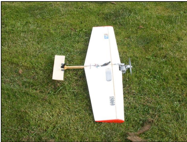
Ready to fly