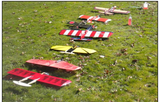
And some more waiting