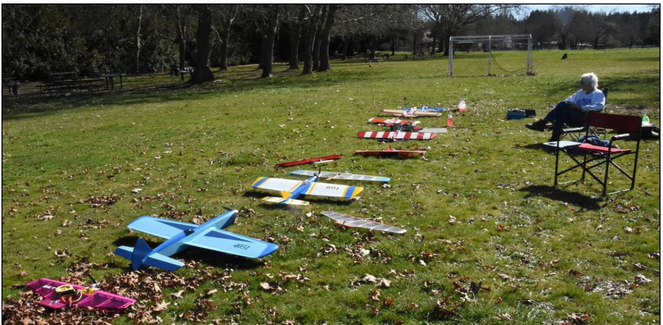
Flight line on March 12.