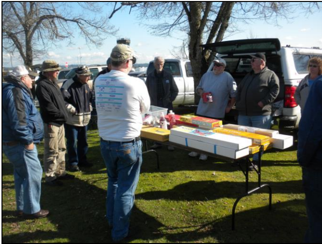
Prize table and some winners