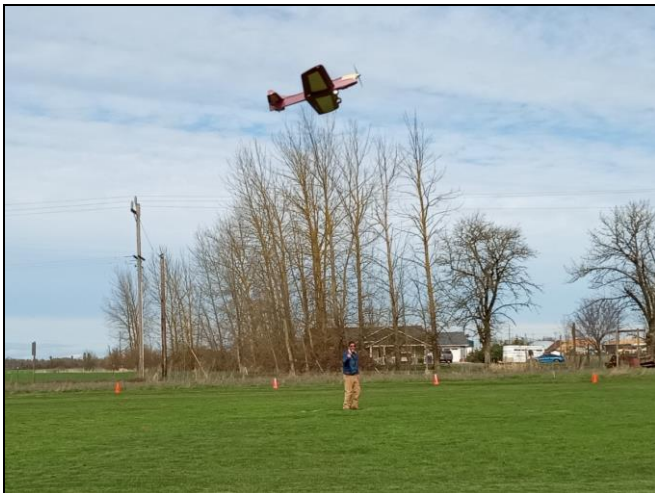
Gary about to loop