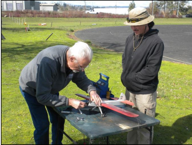
People getting ready to fly