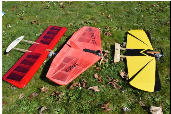
Nemesis, Half Fast III, repaired Sneeker.