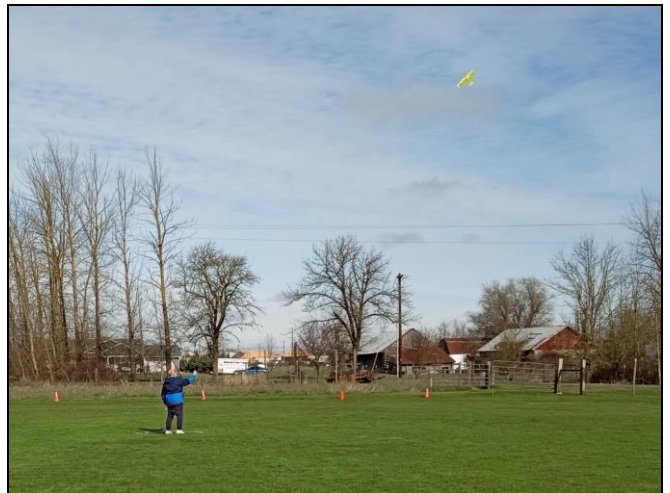
Mike flying down wind