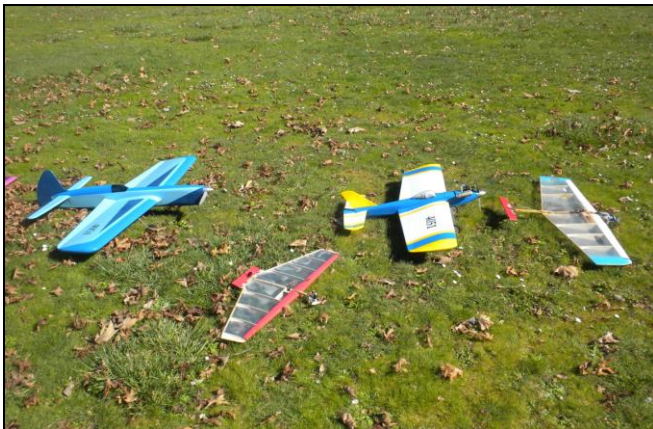
Airplanes waiting to fly