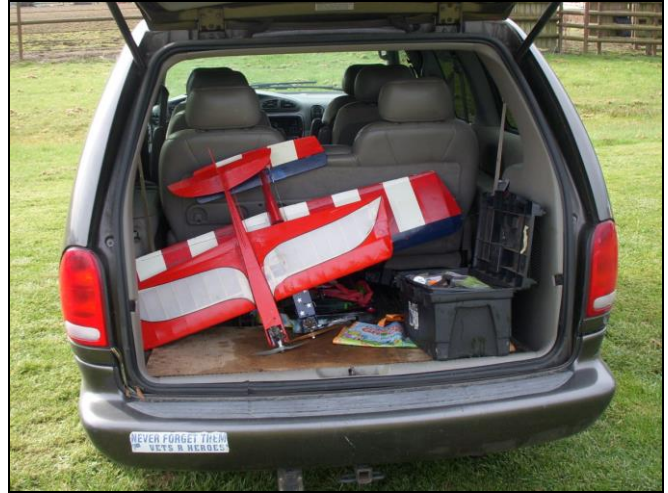
Two of Dave's planes waiting