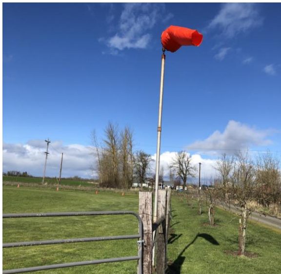
New wind sock installed on Saturday