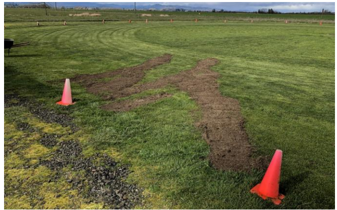
Filled and re-seeded.