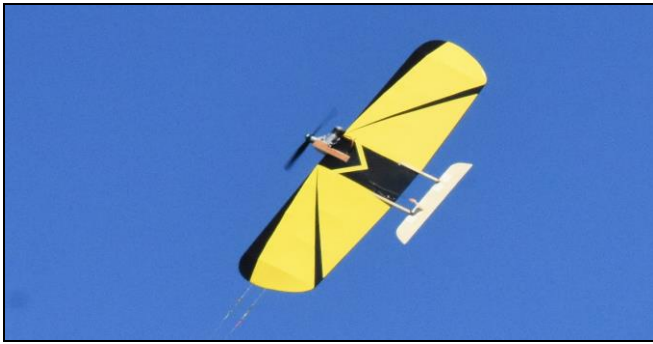
Gene's repaired Sneeker in flight.