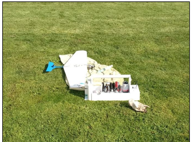
Russ has one waiting