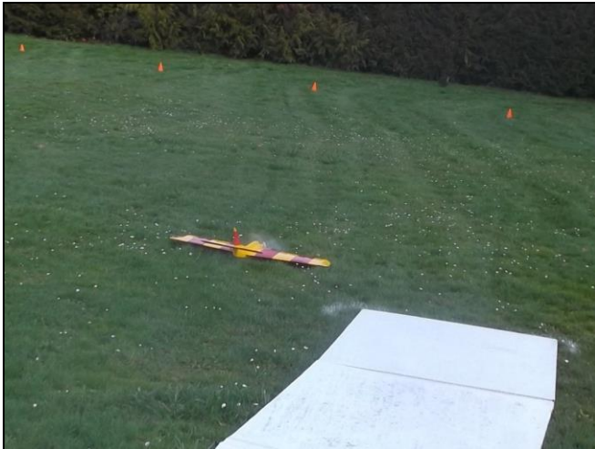
Landed – nice job Gary!