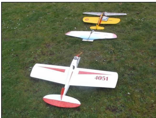
Waiting for a pilot