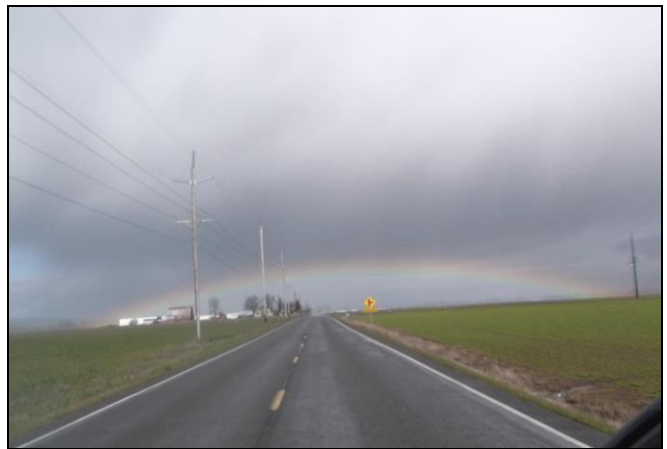
Rain and a rainbow!