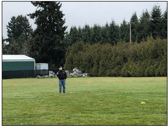
Gene flying. How does anyone get a good picture with a cell phone?.