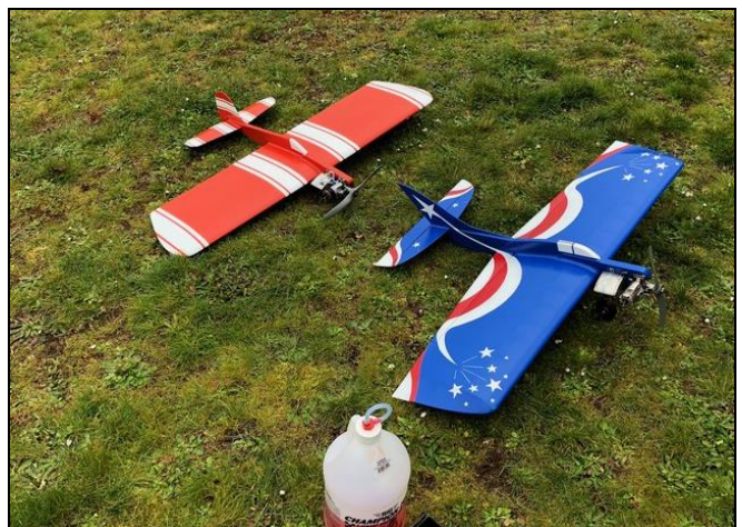
Two of Gary's planes.