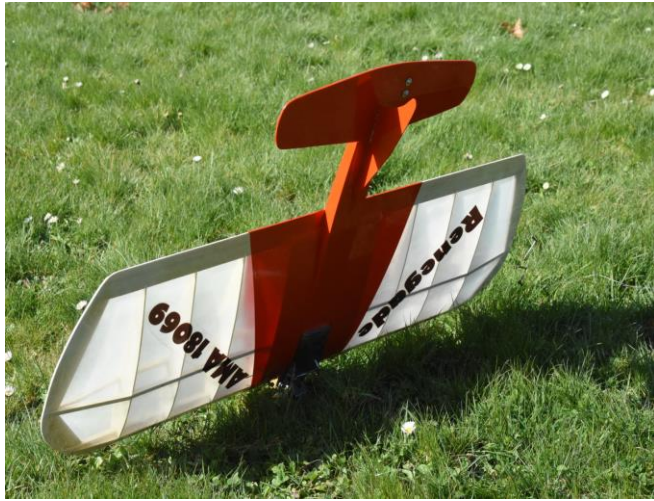
Gene's Renegade after trouble on launch.