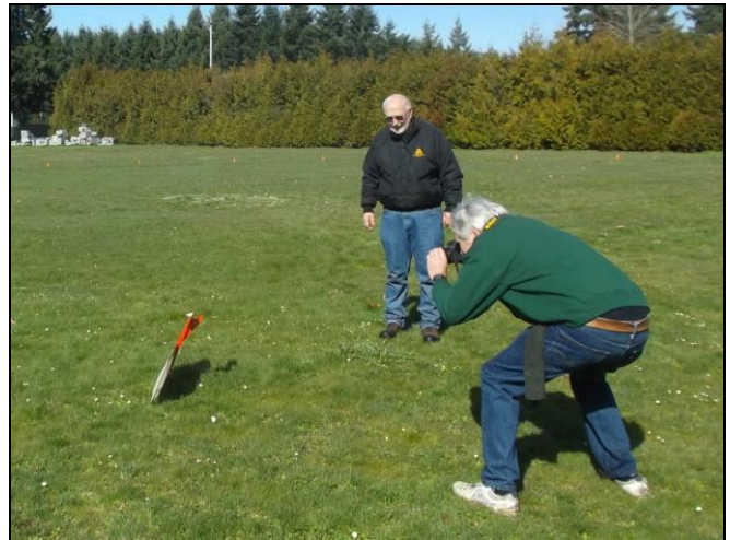
Classic "Lawn Dart Landing"