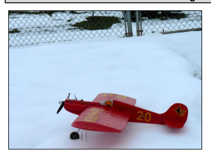
Dave Crabtree - Roseburg area Fliers

Site of the canceled Roseburg fun fly scheduled for March 2<sup>nd</sup>.