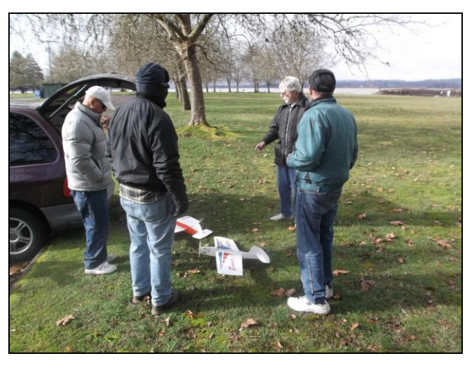
Clown vs Ringmaster discussion