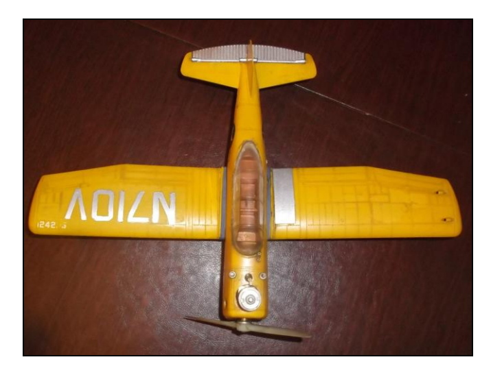
COX Avion Shinn 2150-A, 0.049 powered, 5 1/4 x 4 prop