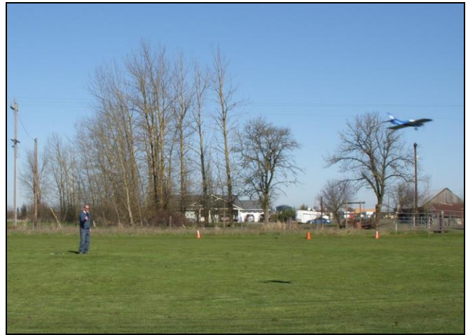
Gary making a landing approach