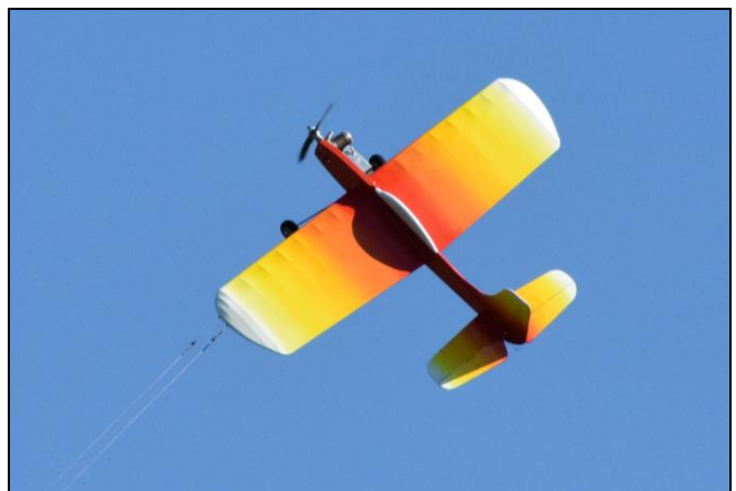
Gary Weems's Tomahawk in a wing-over