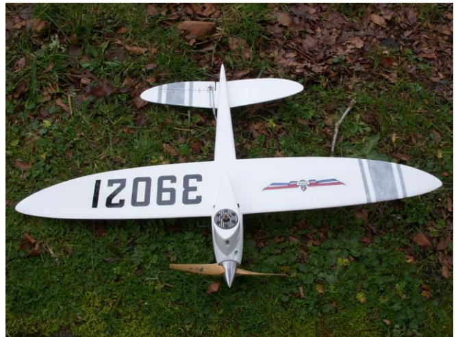
The Show and tell plane