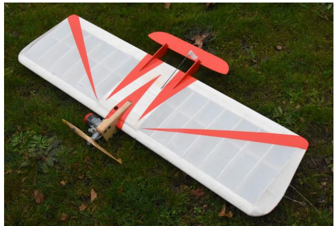
This is Gene's new VooDoo, finished with laminating film over silk, powered by Fox Rocket.