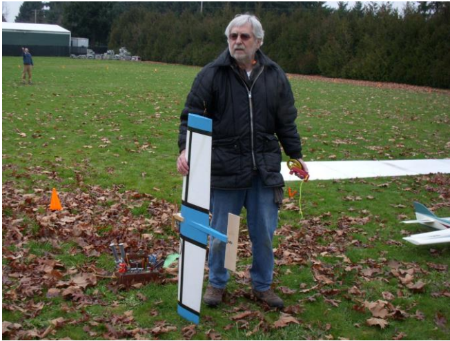
About to be fueled