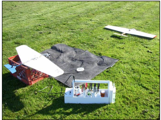
Russ's plane ready