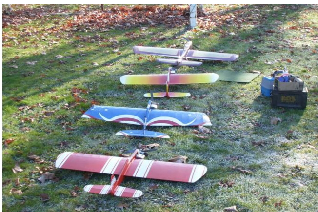
Gary has several ready to go up