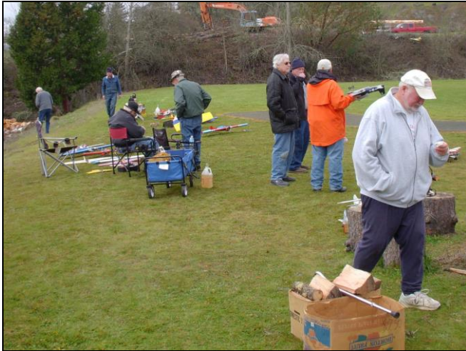
People getting ready to fly