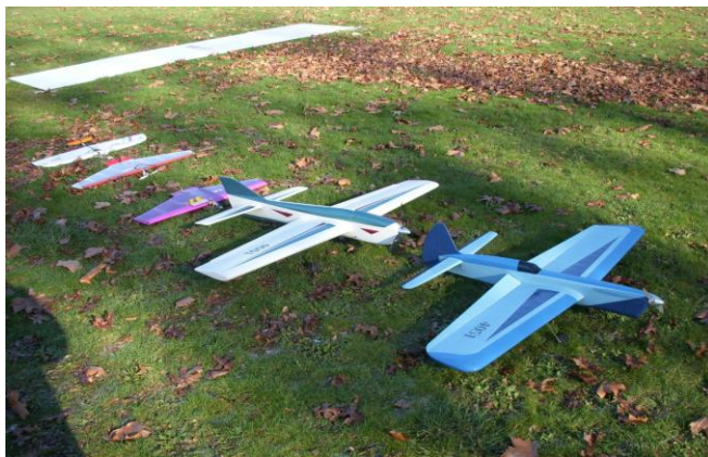
Lines not attached yet