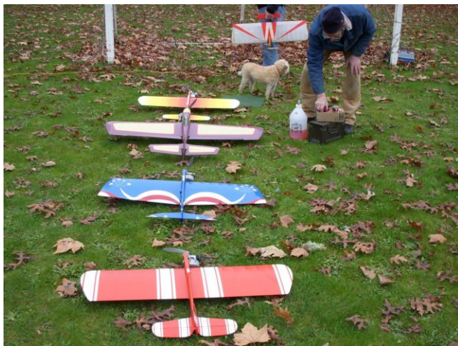
Gary's planes waiting