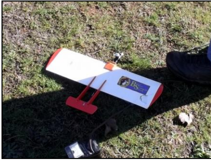
Wido Satan waitin