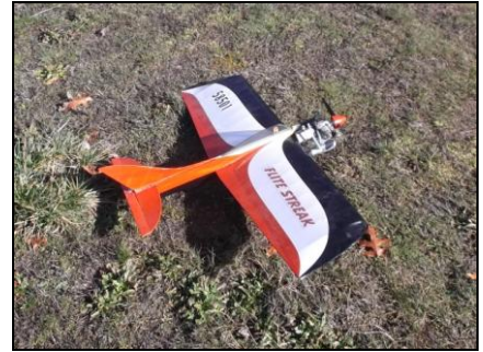
Flite Streak ready