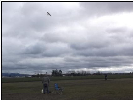
Staying down wind