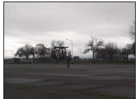
In the air