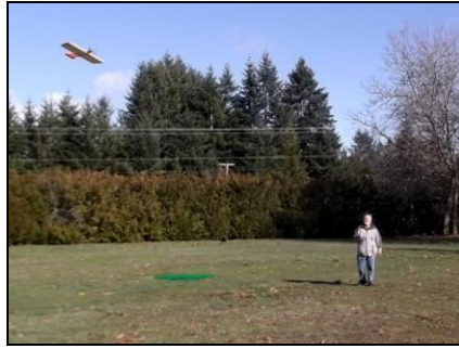
Wido Satan flyin