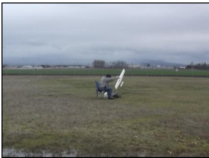
Gene's combat ready