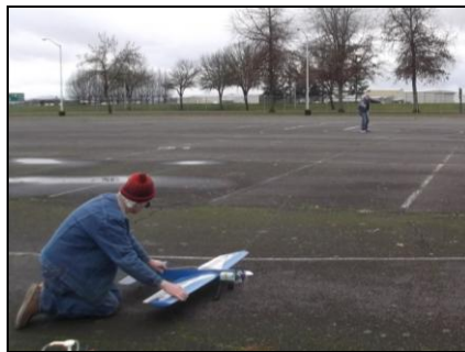
Ready to launch