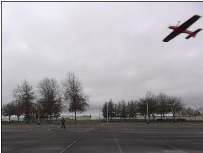
It flies both ways