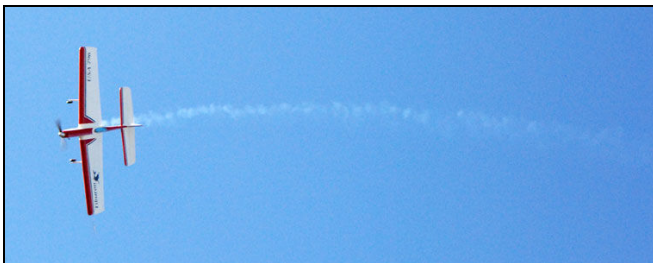
Up close aerial view of Floyd's Tiburon