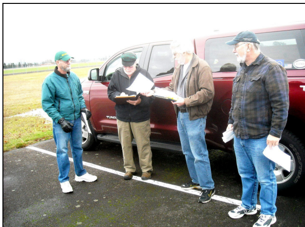
Taking care of business.