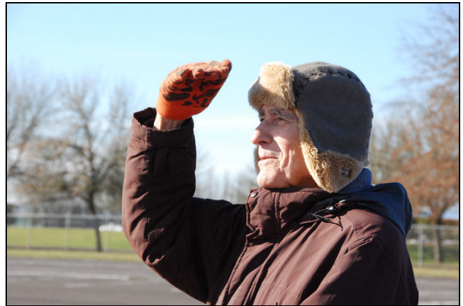
Don't let the sun get in your eyes