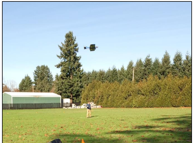
Gary making a landing approach