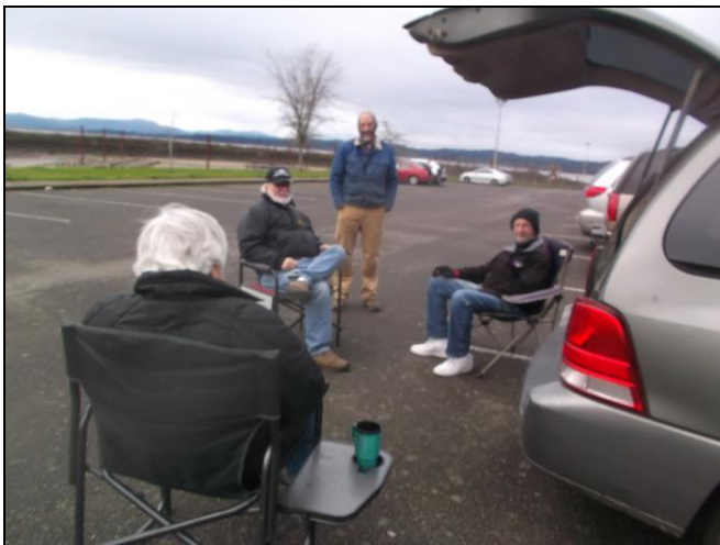
The meeting begins