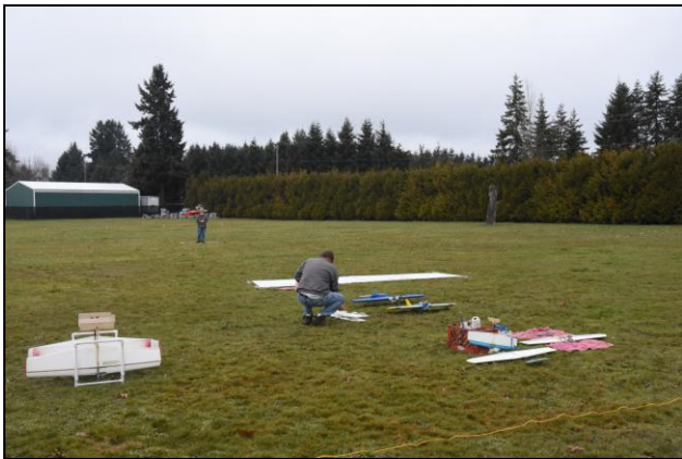
Another view. Gene's head is replaced by the Super Clown.