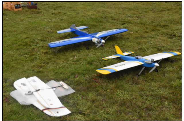
Some of the pits on Dec. 23.