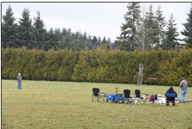
Alternative view. It's just a matter of where you want the plane to be.