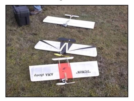
Gene's combat collection