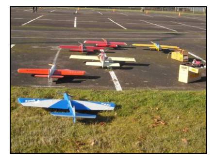
Hanger starting to fill up