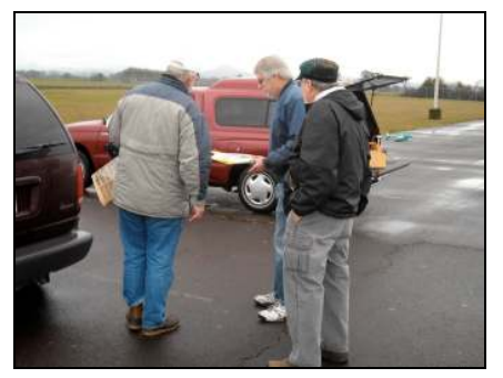
It has flown a time or two.