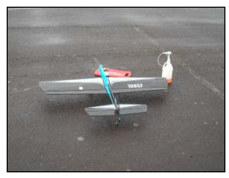
On the ground.