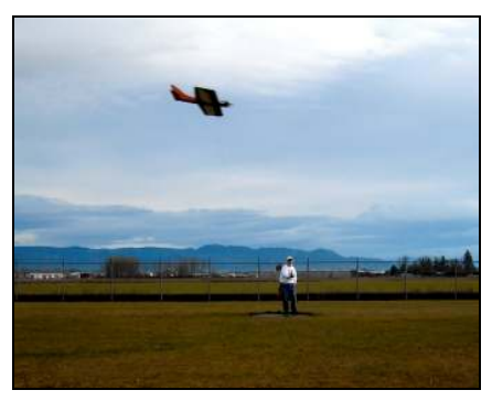
That's the way!