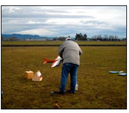
Gene ready to streak the field