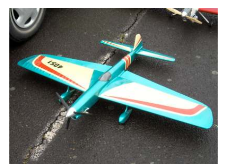
This still looks good!