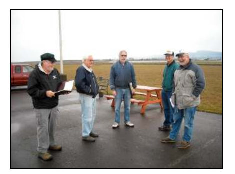
It's a meeting.