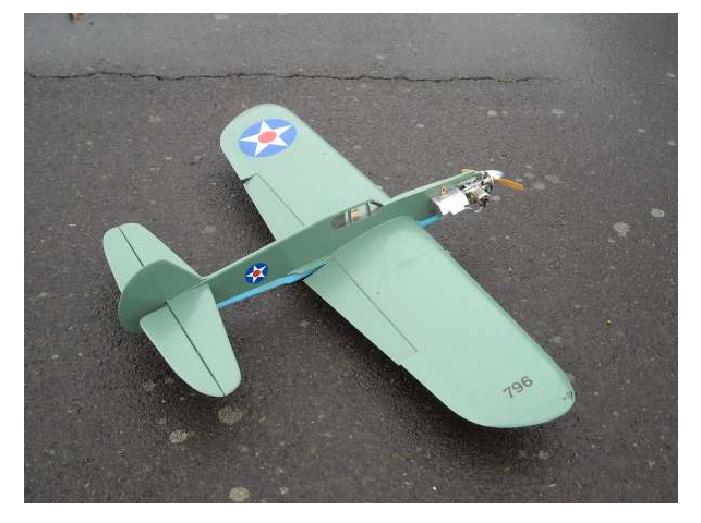
P-40 Profile - OS Max 40 fp