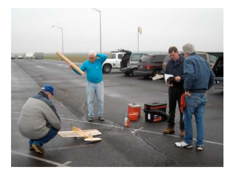
Hook up the lines...