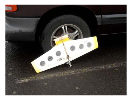
Normal angle of attack ?